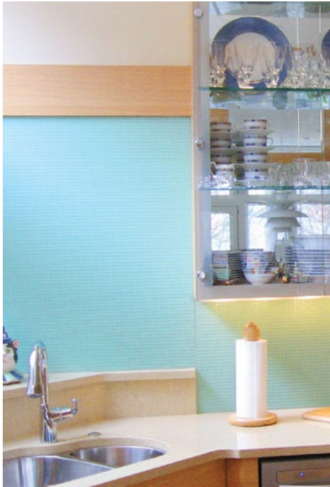
ASK US ABOUT THE FERRIS WHEEL LINE OF METALLIC PAINTED PATTERN GLASS.